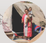
SYRIA - More than 7.6 million Christians have been displaced since the beginning of the ISIS conflict in Syria.