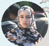
ALGERIA - Family persecution is a dangerous issue. Women are often imprisoned in their own homes when their Muslim families learn of their faith.