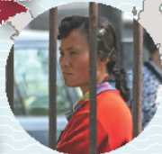
NORTH KOREA - Holding steady for the 14th consecutive year as the worst place for Christians to live. Up to 70,000 Christians are held in prison camps for their faith.