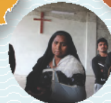
PAKISTAN - Notorious for its unfair treatment towards religious minorities, Pakistan's blasphemy laws are particularly severe.