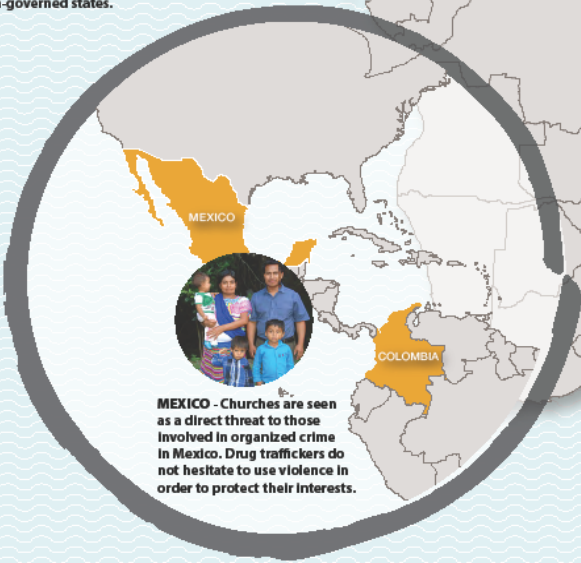
MEXICO - Churches are seen as a direct threat to those involved in organized crime in Mexico. Drug traffickers do not hesitate to use violence in order to protect their interests.