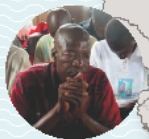
NIGERIA - The church in northern Nigeria faces frequent attacks from Islamic extremist group Boko Haram as well as social pressure from its Sharia-governed states.