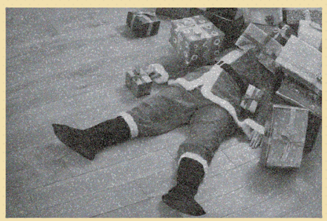
The past, Santa had one to many sherries. The present, was on his head. The future, is uncertain.

Local police have reassured the public that the presence of an empty Sherry bottle at the scene of the incident is purely coincidental, but are not ruling out foul play. P.C. Plod of the Hemsworth mounted division told us, "There are certainly many villages nearby that would happily see Hemsworth-on-the-Mound struck from the map at this years annual village of